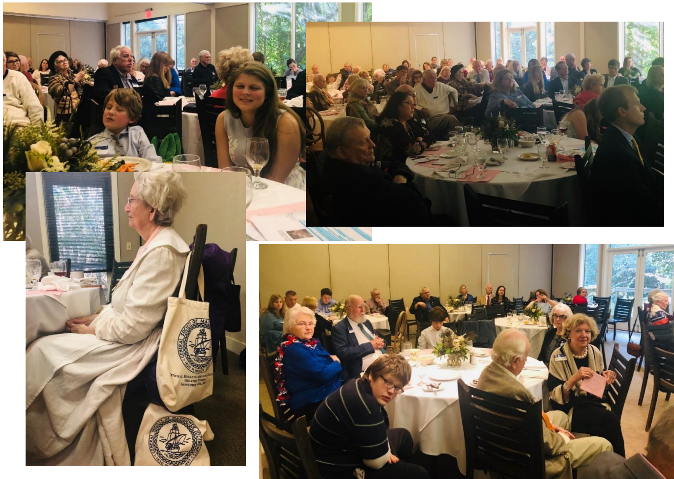
Compact Day Luncheon 17 November 2018.