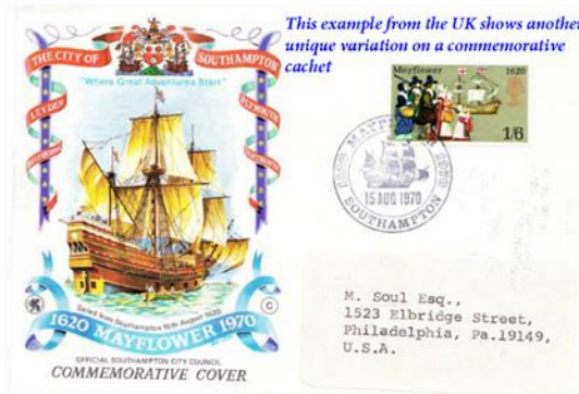
This example from the UK shows another unique variation on a commemorative cachet