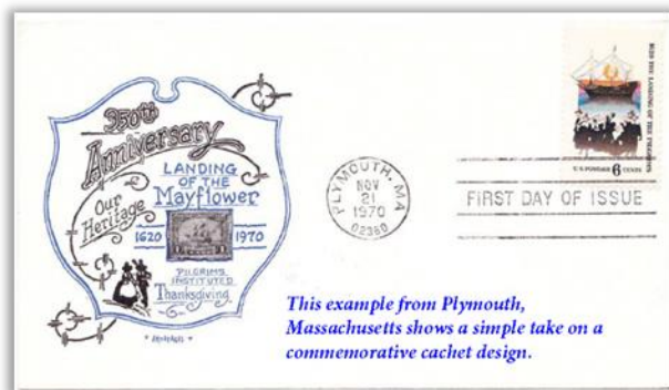
This example from Plymouth, Massachusetts shows a simple take on a commemorative cachet design.

Examples of postal artwork from past commemorations: